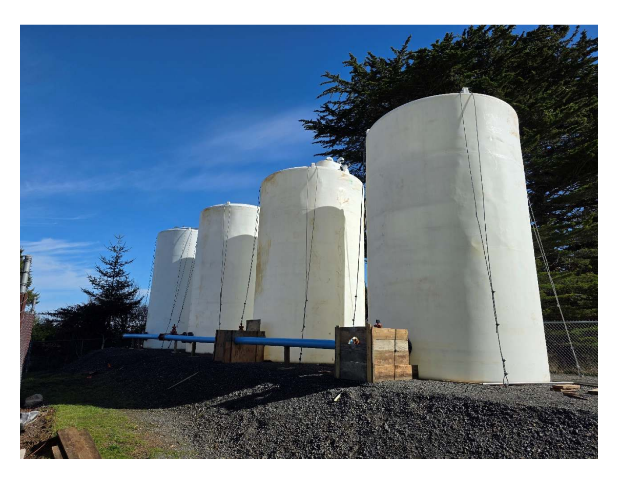
Figure 1: This picture shows the four recently installed temporary water storage tanks at the District's Donna Drive Water Tank Site.